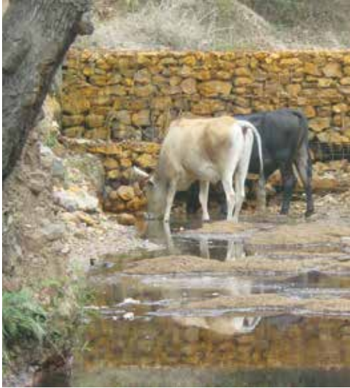
▲ Cattle drinking water contaminated by the activities of Goldcorp Inc. in Valle de Siria, Honduras.