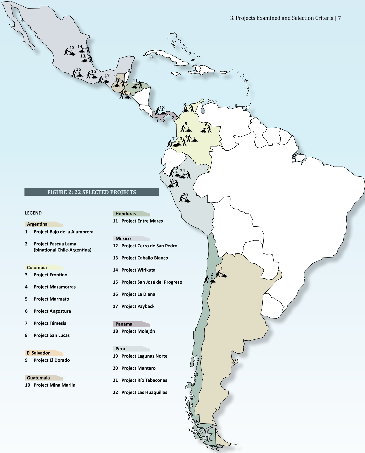
FIGURE 2: 22 SELECTED PROJECTS