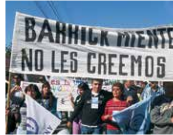
▲ Members of the Congregación de Hermanas del Buen Samaritano in a demonstration in Vallenar, Atacama region, against aids offered by Barrick Gold.