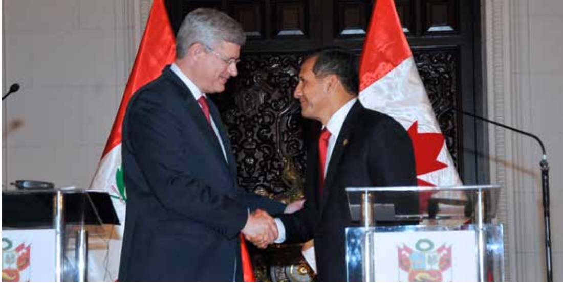
◀ Meeting between Prime Minister of Canada, Stephen Harper, and the President of Peru, Ollanta Humala, on May 22, 2013.

Days after the visit, the executive branch of Peru issued two supreme decrees to facilitate investments, further relaxing the legal frameworks applicable to extractive industries, especially mining. Some years ago, PERCAN, the bilateral agreement between Canada and Peru, served as the platform for advising Peru on the implementation of mining sector regulations. The framework for the enactment of Peru's current regulations on the environment and citizen participation in the mining sector was established pursuant to PERCAN.