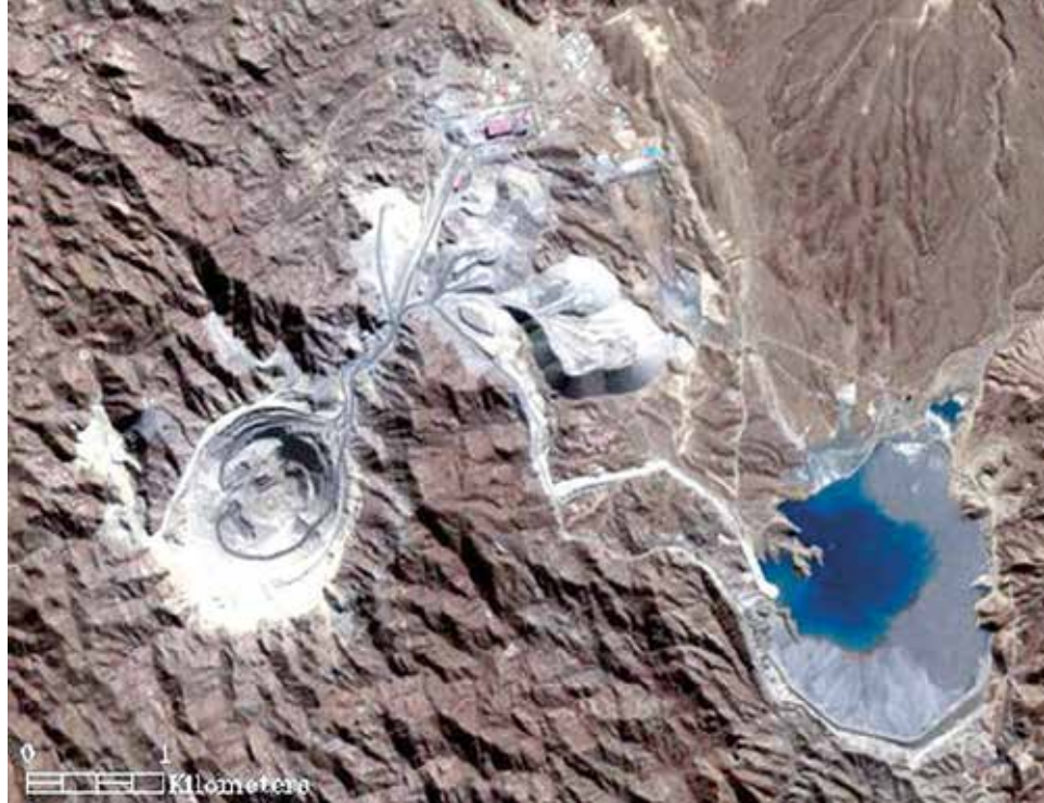
▲ Bajo de la Alumbra Mine in Argentina.

instance by the Chilean Supreme Court on September 25, 2013, 30 on the basis of evidence of underground water contamination in the Toro 1, Toro 2, and Esperanza glaciers. This information has been corroborated by the National Geology and Mining Service and the Environmental Evaluation System, which issued its original order in October 2012 for the suspension of drilling by Barrick Gold. 31