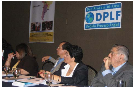
Participants at DPLF and Casals/Salvador's seminar on judicial independence and accountability in El Salvador, in July 2006.

El Salvador. This workshop brought together—in some cases for the first time—representatives from government agencies and non-governmental organizations during a very tense time in El Salvador. The event benefited from the presence of DPLF's country consultants, who were in San Salvador for a methodology meeting for the Judicial Corruption project. They were able to present their country's experience and participate in the general discussion. The report from this workshop is currently in distribution.