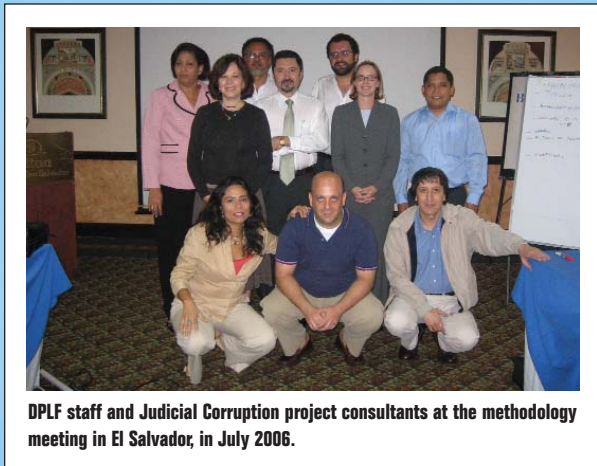
DPLF staff and Judicial Corruption project consultants at the methodology meeting in El Salvador, in July 2006.

The results from this project will be published in a book which will include a study from each of the countries (Guatemala, El Salvador, Costa Rica, Nicaragua, Honduras, and Panama), and a comparative evaluation that will bring together the conclusions and findings of the study. The publication will be presented in special events in Central America and Washington, DC to help disseminate the findings.