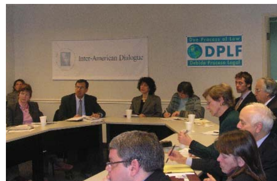
Participants at DPLF and the Inter-American Dialogue's meeting on Judicial Reform in Colombia, in December 2006.

During 2006, DPLF continued its active participation in the regional discussion and dialogue on judicial reform in diverse ways: membership in various networks, presentations at conferences and seminars,