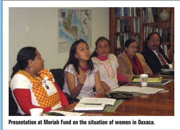
Presentation at Moriah Fund on the situation of women in Oaxaca.

This time the hearing addressed the political violence that erupted in Oaxaca over the summer months, as well as the due process and human rights violations that fanned the flames of the unrest. The hearing resulted in the Commission’s agreement to conduct an official visit to Oaxaca in 2007 in order to examine the human rights situation.